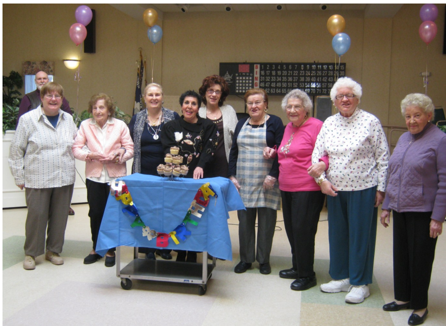
SMRAC Celebrates January Birthdays